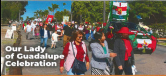
Our Lady of Guadalupe Celebration